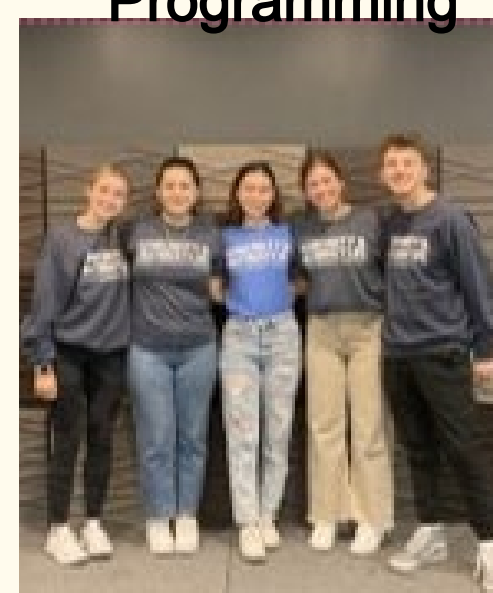
Sorority & Fraternity Life