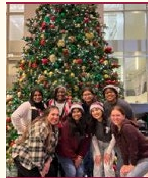
Dept. of Programming