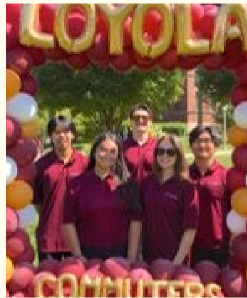
Commuter student Life